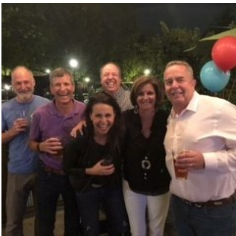
The classes of 1971 (left) and 1980 (right) reunited during Homecoming weekend October 23, 2021, as did the