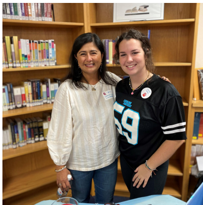
Above and below, Alumni and legacy students gathered for the annual Alumni and Legacy Breakfast and Lunch Events October 21 and 22, 2021