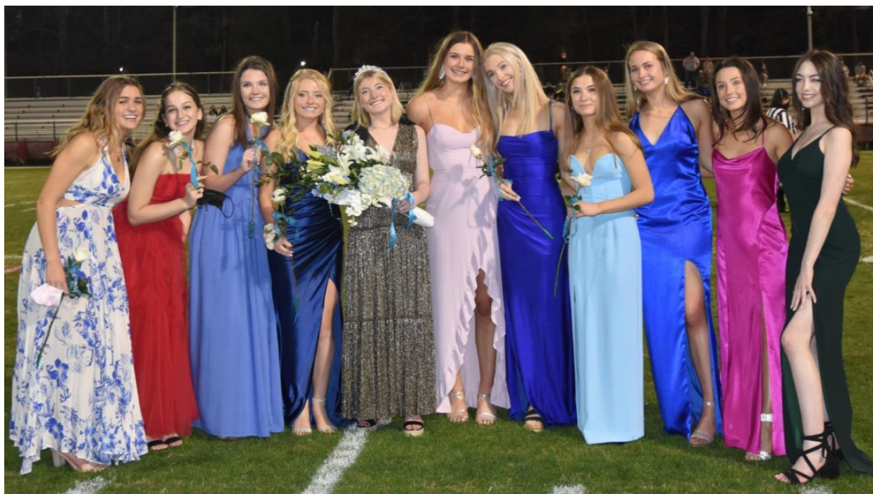
Homecoming ceremonies followed COVID-19 safety protocols. Masks were only removed for photos.

We are excited to announce that the Homecoming game for the 2021-2022 season will be on October 1. Details about Homecoming events will be provided closer to the fall.