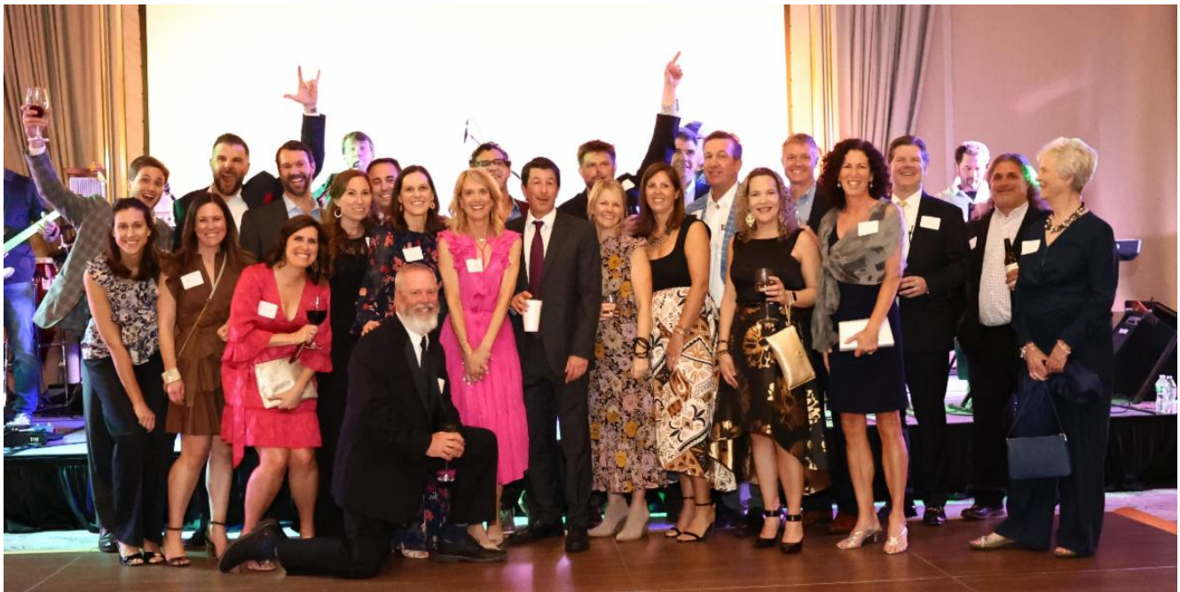
Charlotte Catholic High School Alumni enjoying the CCHS Gala on March 19!