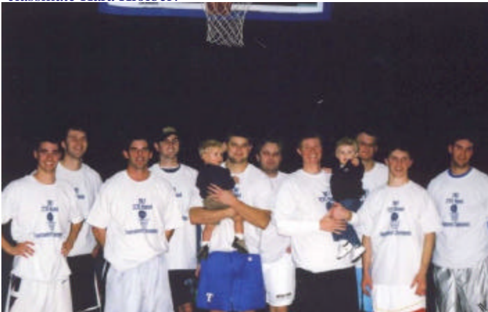
Team Hazen's Heroes — Winners of the 2003 Alumni Basketball Tournament