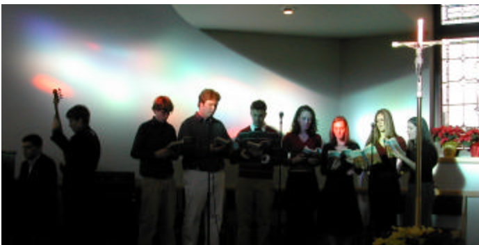
Students and Alumni at Charlotte Catholic's Christmas Eve Mass